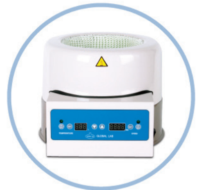
GLHMSD (2l ~5l )