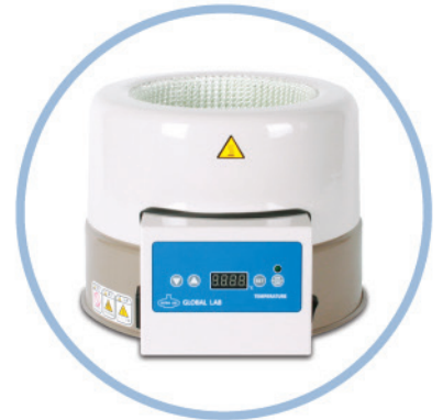
GLHMD (2l ~20l )