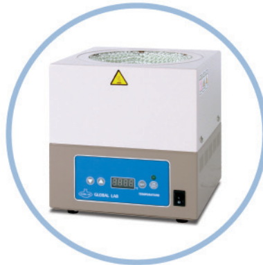
GLHMD (100ml ~1l )