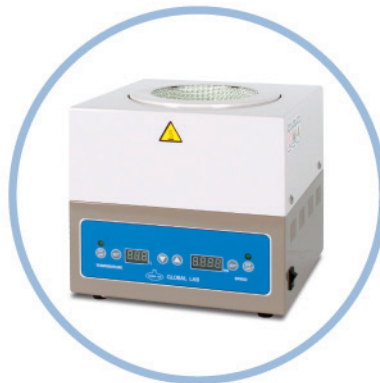
GLHMSD (100ml ~1l )